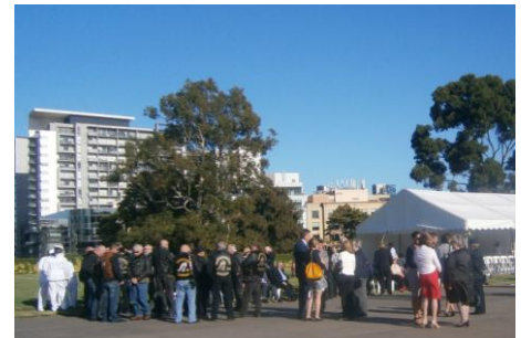
Bloody bikies left of the picture

Allan Tonkin was critical of the bloody motorcycle gang and the attention they seem to get. However they outnumbered the RAR member attendance significantly.