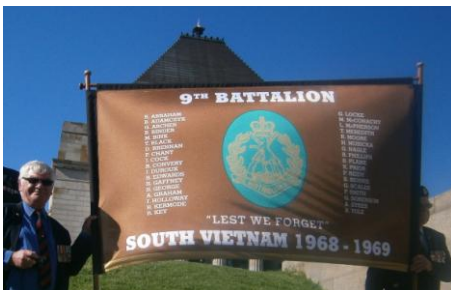
THIS IS ALL THE BANNERS THAT VICTORIA COULD MUSTER